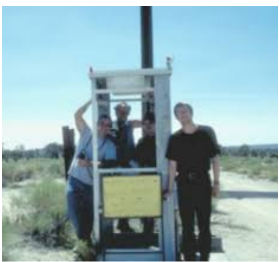
My Parting Message !! OOOH RAH !!