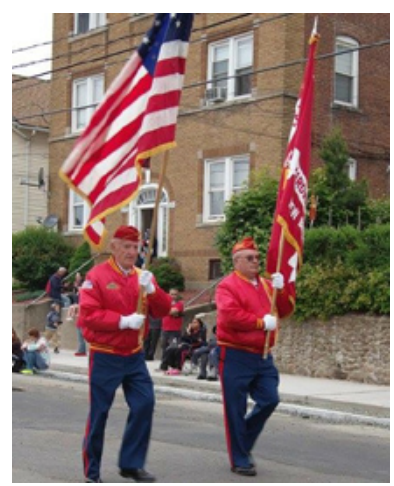
Flag Retirement on Flag Day In Plainville CT. Our Biker Escort for Our Retiring Flag

Time For The Parade and Photo Op with the Mayor. OOOH-RAH!!!