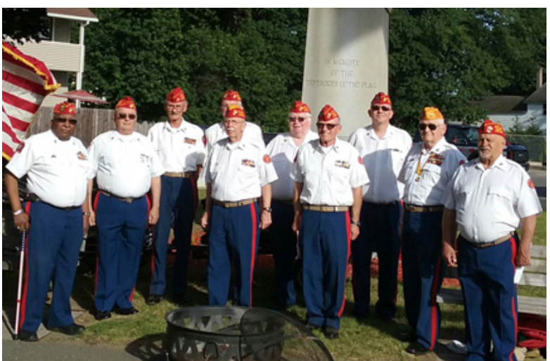
The Boys Are Back In Town For This One